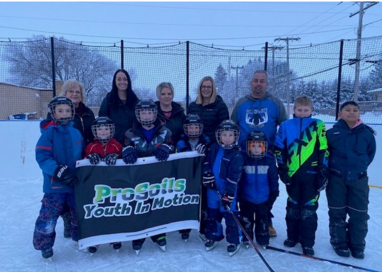
Thank You to ProSoils Youth in Motion for supporting the PCU Park Outdoor Rink