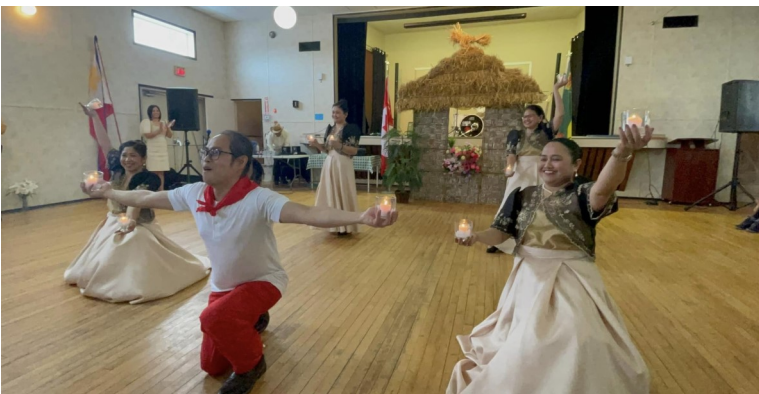
Filipino dance performance