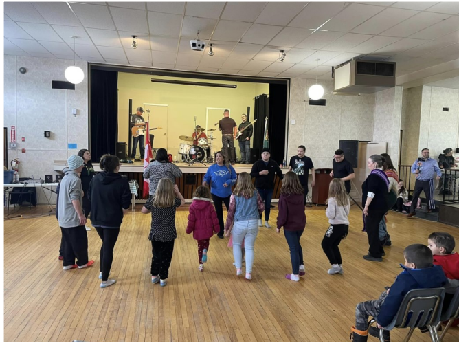
Members of Creeland Dancers showed attendees some jigging moves