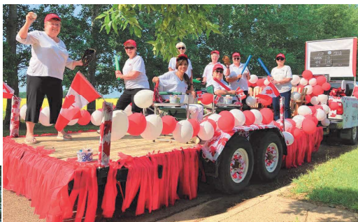
Healthcare Auxiliary earned 2nd Prize with their tribute to "A League of their Own"