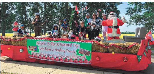
1st Prize Float entered by Porcupine-Carragana Hospital