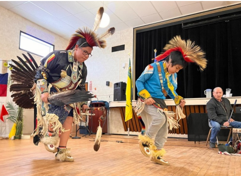
[Left] Youth dancers with PP Filipino Community Group