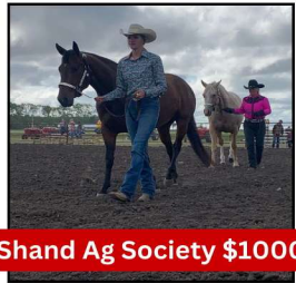
Shand Ag Society $1000