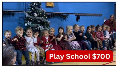
Play School $700