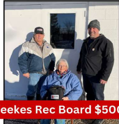
Weekes Rec Board $500