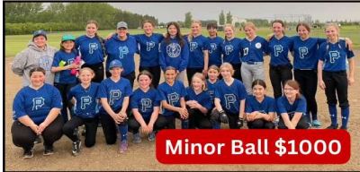
Minor Ball $1000