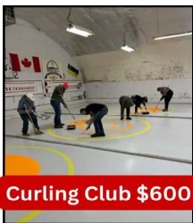
Curling Club $600