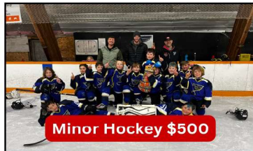
Minor Hockey $500