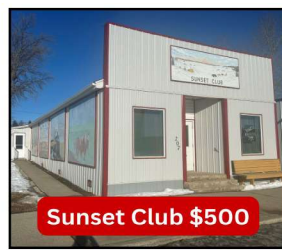
Sunset Club $500