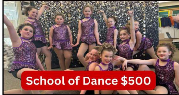
School of Dance $500