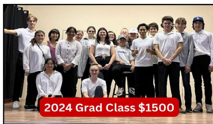
2024 Grad Class $1500