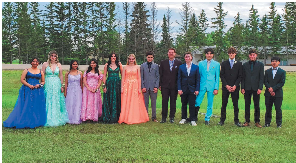
Congratulations to the PPCS Graduating Class of 2024!